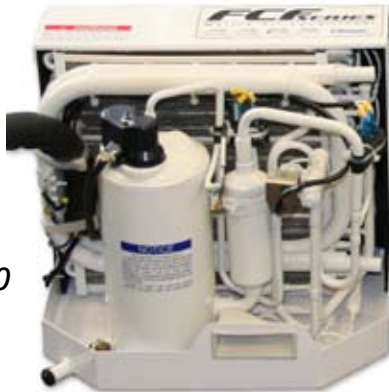
FCF 12000 12000 BTU