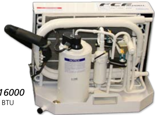
FCF 16000 16000 BTU