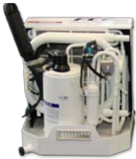
FCF 5000 5000 BTU