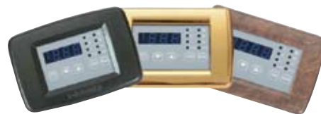
Electronic controller with interchangeable bezels