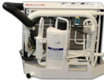
FCF 9000 9000 BTU